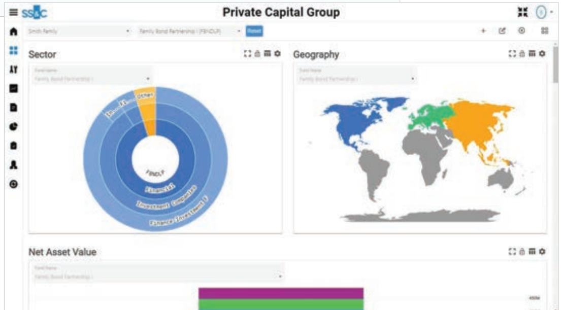
Geographical display of investments