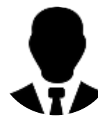
M Chief Security Officer for a Forbes global Top 20 Family